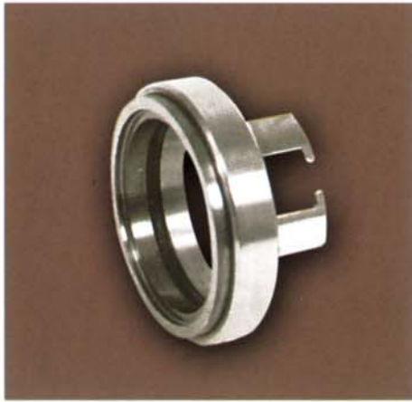
1.1 1/2" Inner Rotary Head and 2" Outer Rotary Head