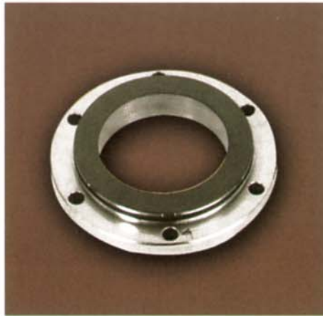
1.1 1/2" Inner Running Face