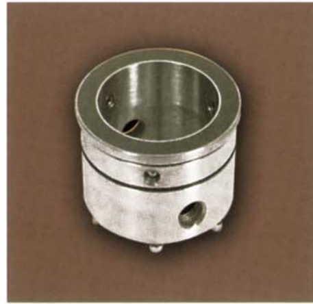
2" Outer Running Face